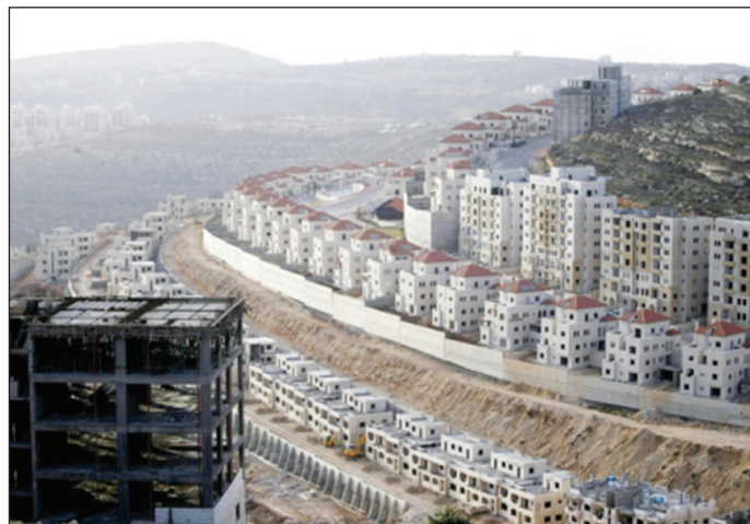
Illegal Israeli settlement construction in the occupied West Bank continues apace

Today there are approximately 125 Israeli settlements in the West Bank and twelve neighbourhoods in Jerusalem. There are also a further 100 "settlement outposts" – these are smaller