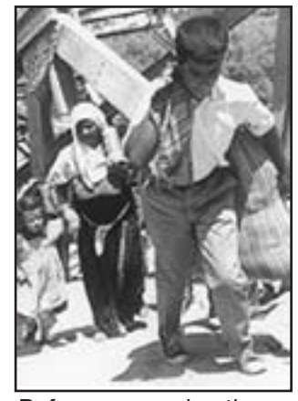
Refugees crossing the Jordan river in 1948

In other villages the inhabitants were allowed to leave their houses, but not to take their possessions with them, before their homes were blown up and their village flattened. There were many other brutal massacres, for example on May 22, 200 men between the ages of 13 and 30 were murdered in cold blood at Tantura.