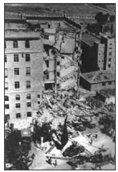
The King David Hotel in Jerusalem, HQ of the British army, bombed by the Irgun gang in 1946. 91 people died.

tolerated largescale Jewish immigration. This created intense resentment in the Arab population. Eventually, but inevitably, resentment erupted in violence between the Arab majority population and the Jewish minority population.