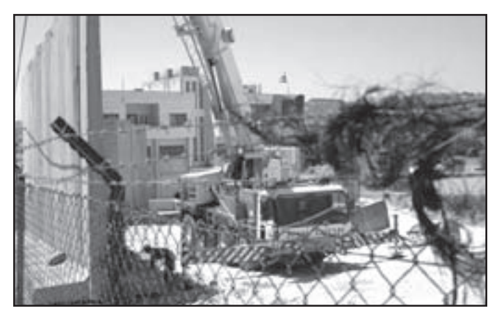
Land grabs and ethnic cleansing continue with the building of the Wall, deemed illegal by the International Court of Justice and the UN

Israel has walled the city off from the rest of the West Bank.