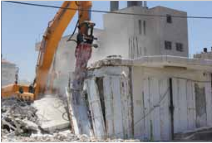
Shops and homes being demolished in Beit Hanina

In other parts of the city, demolition is the preferred mode of ethnic cleansing. According to Israeli statistics, from 2000–2008 the Israeli authorities demolished more than 670 Palestinian homes in East Jerusalem. According to the UN, about 60,000 Palestinians risk losing their homes. 3 Families may pay large sums of money to the Israeli authorities, simply to have the demolition order postponed.