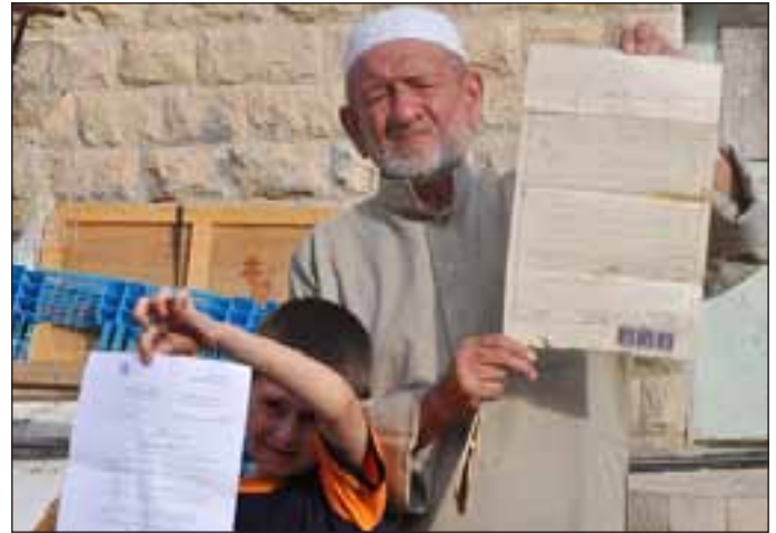
Inhabitants of Silwan with eviction orders

• Property is seized on the pretext that it was once in Jewish ownership, often on very flimsy or forged evidence. However,