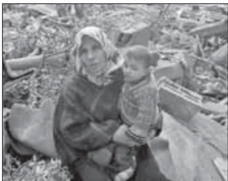
Homeless in Gaza.

During and after the assaults on Gaza, Israel's principal trade union organisation, the Histadrut , endorsed its government's actions absolutely, echoing their line that sole responsibility for all deaths lies at the door of Hamas. (This, despite the fact that even the Israeli government's own spokesperson Mark Regev conceded that it was the Israeli forces who ended the ceasefire on 4 November, by their assassination of six Hamas members.)