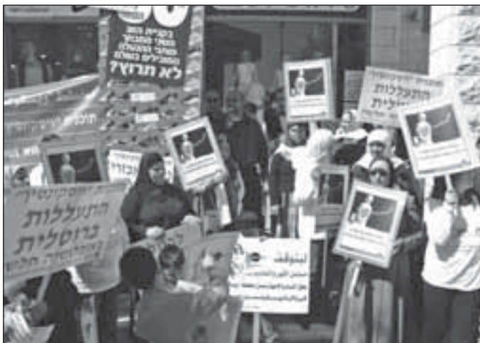
Demonstration in Nazareth against the Wisconsin plan.

Sawt el-Amel ('The Laborer's Voice' — www.laborers-voice.org ) is one of the most active organisations within Israel working to fight discrimination in the workplace and to protect the rights of workers of Palestinian origin. Based in Nazareth, they are currently opposing the welfare-to-work Wisconsin Plan, a scheme also opposed by unions in Britain, but backed by the Histadrut. It will have a particularly adverse effect on Palestinian workers and their families. In addition they are working to restore money running into millions of shekels owed to workers from Gaza by Israel-based employers.