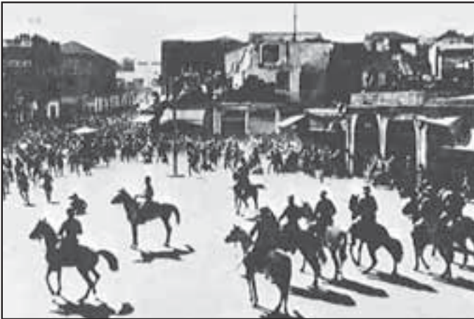
British troops disperse a demonstration in Jaffa in 1933.

Frequently the British authorities played a role in assisting the Histadrut. For example, at the end of 1936 all Arab workers were expelled from the Majdal Yaba quarry and Jewish workers were employed. Some 400 Arab workers lost their jobs and British police made numerous arrests of the Arab workers who were trying to defend their livelihoods.